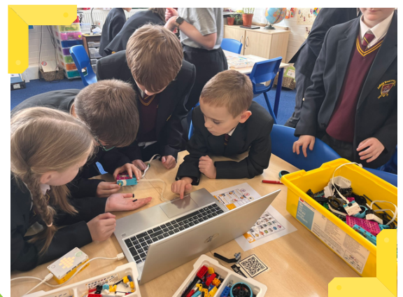
Anfield Road - Da Vinci's were very focused as they worked together to build their robot before programming it.