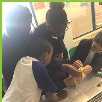
St Michael's - High Flyers