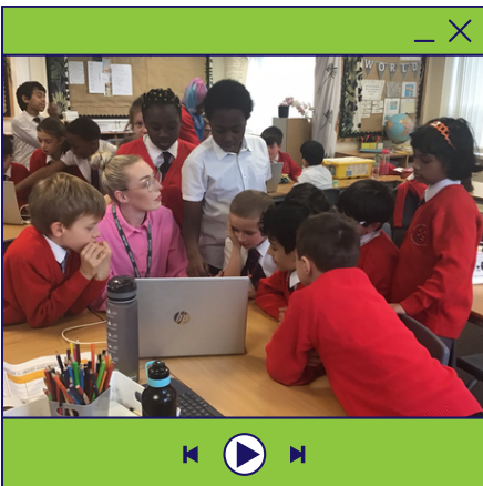
Sacred Heart - using algorithms, and debugging methods, to solve problems using Lego robots.

The computing department have been extremely busy delivering Lego Robotics sessions. Students have used teamwork and problem solving to complete the build of their driving base robot. They then completed several challenges using their computational thinking and programming skills.